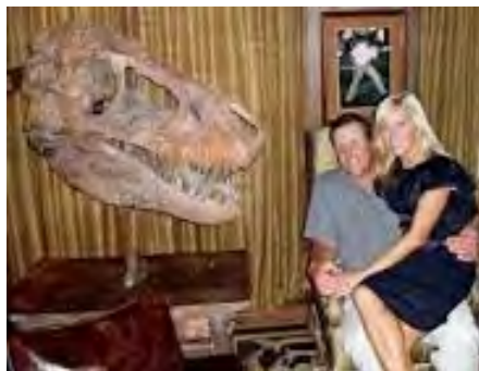
Phil & Amy Mickelson & the dinosaur head