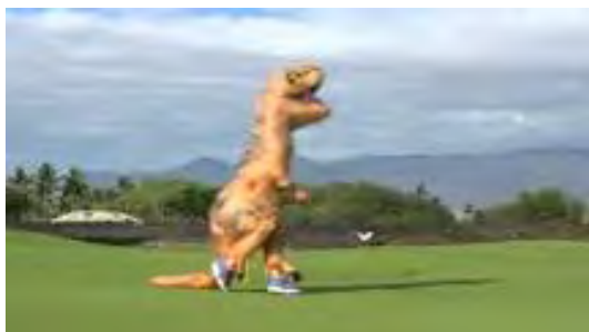
What life was like 68 million years ago.

So who knew? - Phil Mickelson is into fossils & meteorites. He's not only a golf star, he's a rock star!