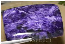
Silky &amp; Chatoyant Charoite

Each month for our club meetings, I choose a "Rock Star" of the month and assemble a few slides explaining the gem or mineral. One of the sources I use to get important details and photos is a website named "GemSelect". This site's purpose is to sell gems & minerals but they have a wealth of information that you can access. GemSelect has a newsletter that you can either subscribe to or review on line. Each month it covers various topics in detail. July's edition is titled "Lovely Gemstone Luster". What is luster? In their article they state "luster refers to the way light reflects from the surface of the gemstone. It's essentially the opposite of brilliance which is the way light reflects from the interior of a stone." Examples with pictures describe the various types of luster such as vitreous, silky, waxy and more. By Googling "GemSelect Newsletters" you can scroll through years of articles, month by month, on different topics. Go to: www.gemselect.com .