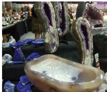
Lapis, Amethyst, Agate