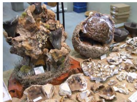
Sharks Teeth & Agatized Coral