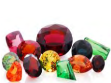
Variety of colors

Ugrandite garnets include Andradite, Grossular, Uvarovite & Hydrogrossular garnets. Andradite garnets are a calcium iron garnets that are red, brown, yellow green or black. The Topazolite (yellow to greenish yellow), found in Arizona & California are in this group, as is the Demantoid garnet, a deep green, found outside the U.S.. Grossular garnets are a light green & can be a cinnamon red. Tsavorite garnets are also in this group and found outside the U.S.. Uvarovite Garnets are a bright green cluster of garnet crystals. They are rare & found in Russia & Finland. Hydrogrossular garnets, also known as Transvaal Jade or African Jade are a massive crystal, usually either green or pink but can be white or gray. Dark inclusions make this look similar to Jade. Garnets have a hardness of 6.5 to 8.5, a SG of 3.5 - 4.3 and a vitreous luster. Garnets are the state mineral of Connecticut, the state gemstone of New York & the state gem of Idaho. They can be cabbed or faceted for any type of jewelry and have a variety of industrial uses from grits to lasers. Garnet is a hall of fame rock star!